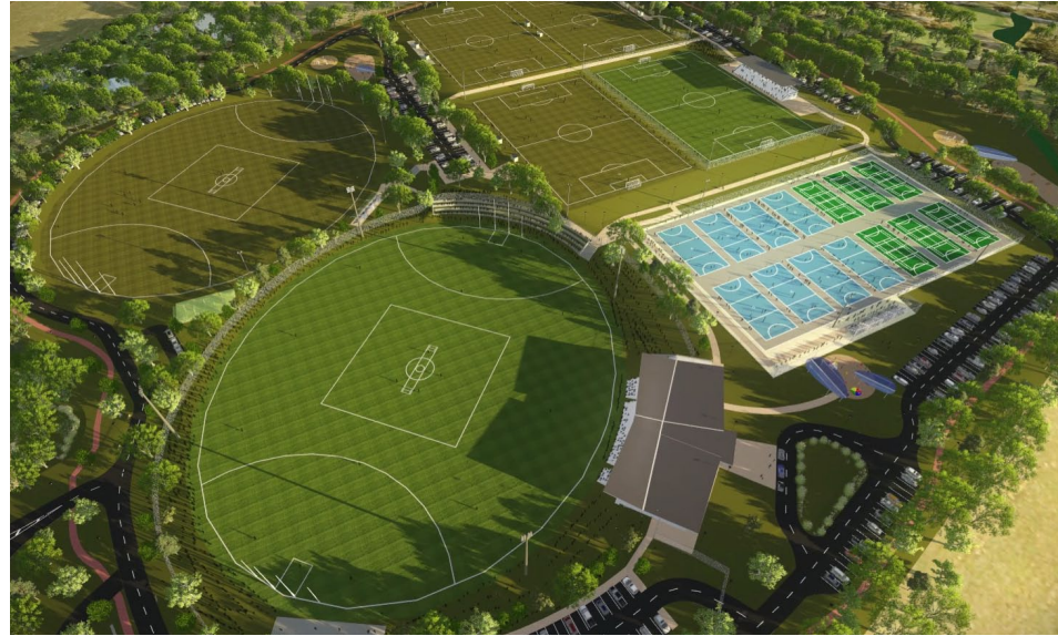
Proposed sporting hub to complement existing facilities

International students will be impressed by the variety of things to do and the ready access to Adelaide and regional attractions